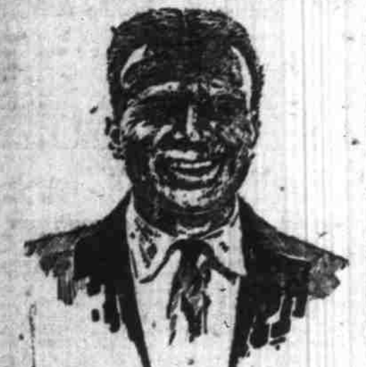
Douglas Fairbanks in Triangle Play, "The Lamb."

The ten committees which have donation to date having been $100 were working in this vicinity in the