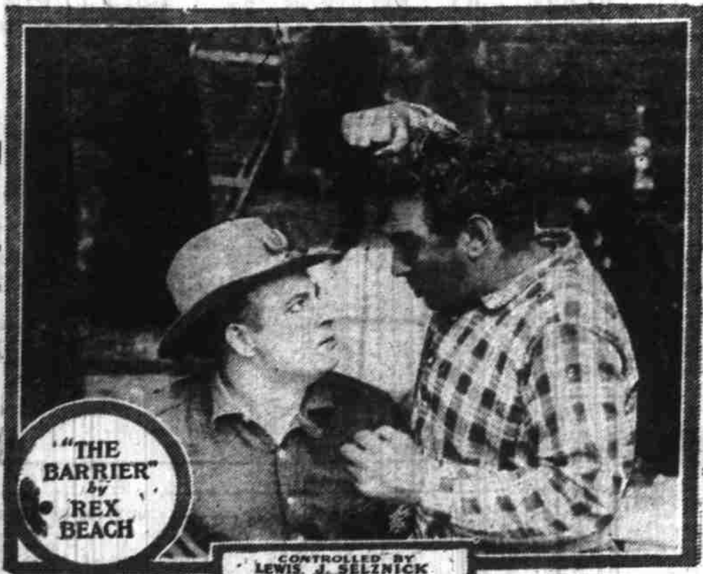
THE BARRIER by REX BEACH

WE HAVE SHOWN SOME MIGHTY PLAYS AT THE LIBERTY, BUT WE NEVER HAVE SHOWN SUCH A VIVID, THRILLING SCREEN STORY, AS THIS GREAT HUMAN, THROBBING EPIC OF THE NORTHWEST