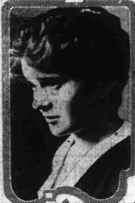
MAE MARSH, Goldwyn Pictures Star