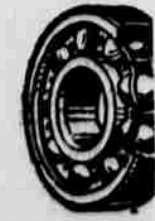
New Depart Ball Bearing