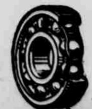
New Departure Ball Bearing

To provide motorists and others interested in automobile service work in this section with prompt, expert dependable service on bearings, we have established an authorized local service station for the Bearings Service Company.