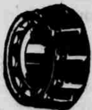
Timken Roller Bearing