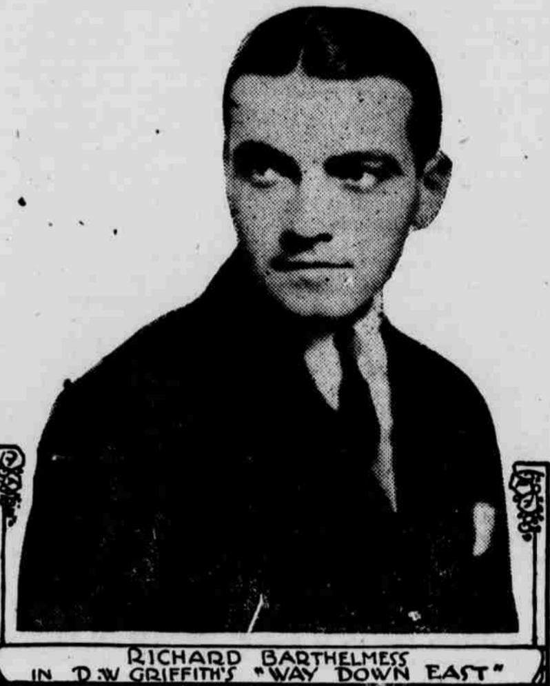
Mr. Richard Barthelmess as David.