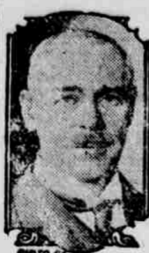
Francis Burton Harrison

Manila.—Francis Burton Harrison, former governor general of the Philippine Islands, offered to tender his resignation eighteen months ago upon condition that the Secretary of War recommend to President Wilson that a Filipino be appointed his successor. He made the offer while in Washington in 1919.