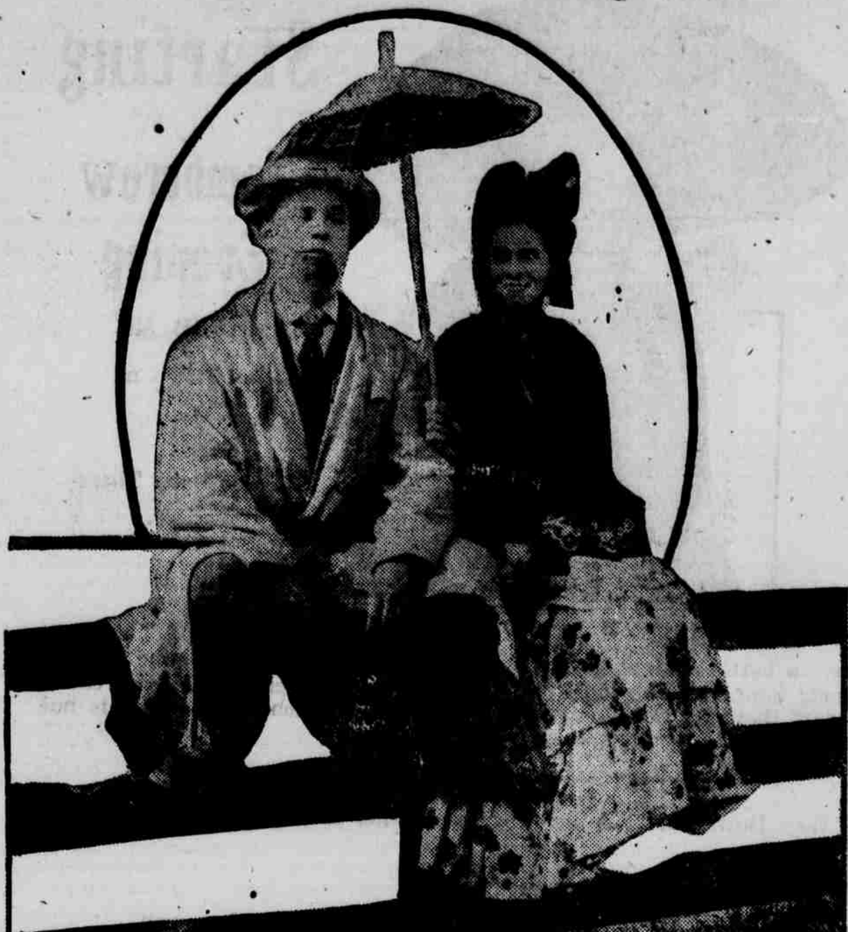
SETH HOLCOMB MAKES LOVE TO MARTHA PERKINS Scene from D.W.GRIFFITH'S "WAY DOWN EAST"