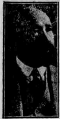
Philippine Resident Commissioner Isuro Gabaldon

Washington. — "Must the heart of America beat only for the freedom of Ireland, of Poland and of the Czech-Slovaks, and not for the independence of the Philippine Islands?"