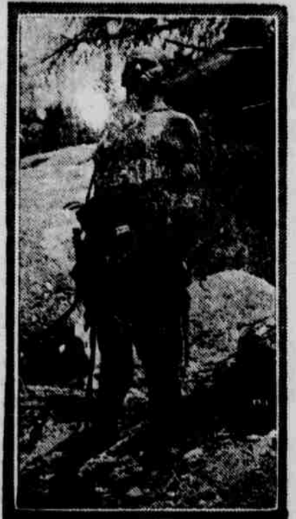
Maurice Tourneur presents The Last of the Mohicans