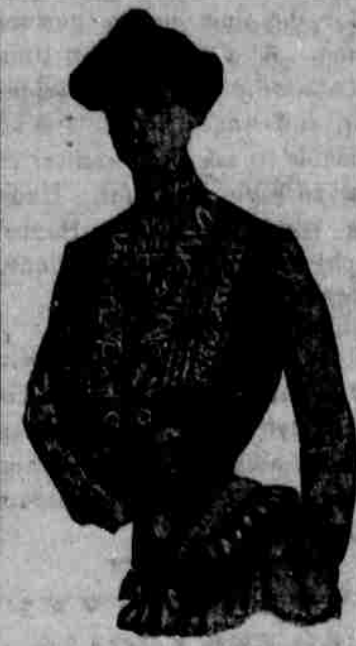
About 60 very stylish Silk and Satin waists at