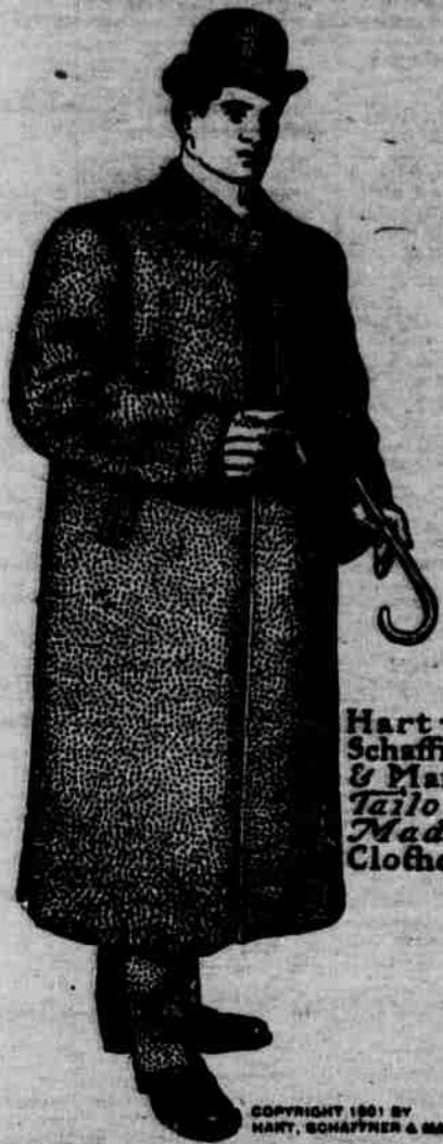
Hart Schaffner & Marx Tailor Made Clothes