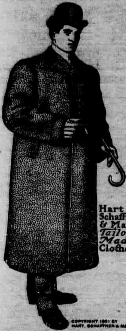
Hart, Schaffner & Marx Tailor Made Clothes