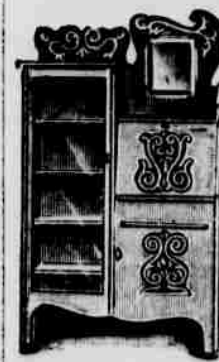
GOLDEN OAK Book Case; Highly Polished; as low as $12.50.

to buy your Furniture abroad. Besides saving you a freight bill, we also save you from 15 to 25 per cent. on each and every article purchased from us. Be wise and consider our low price offers.