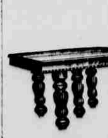
Fine Polished Extension Table; hard wood; as low as $4.50