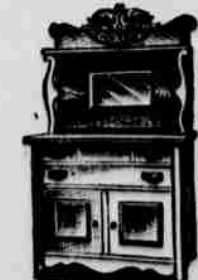
Golden Oak Side Board... $9.50

Our great line of Carpets, Linoleums, Oil Cloths and Mattings at correspondingly low prices.