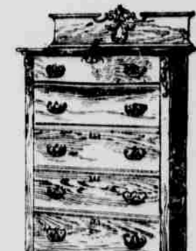
GOLDEN OAK Chiffonier; as low as $5.75