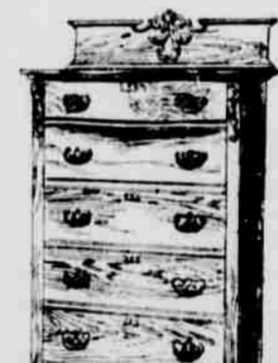
GOLDEN OAK Chest; as low as $5.75.