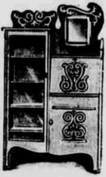
GOLDEN OAK Book Case; Highly Polished; as low as $12.50.

to buy your Furniture abroad. Besides saving you a freight bill, we also save you from 15 to 25 per cent. on each and every article purchased from us. Be wise and consider our low price offers.