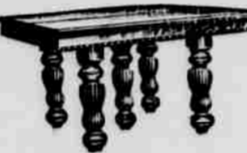
Fine Polished Extension Table; hard wood; as low as $4.50.

Our great line of Carpets, Linoleums, Oil Cloths and Mattings at correspondingly low prices.