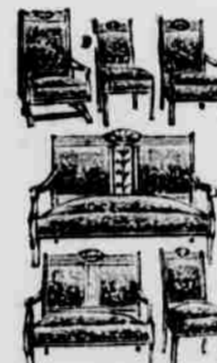
5-piece Parlor Suit; fancy upholstered; as low as $22.50.