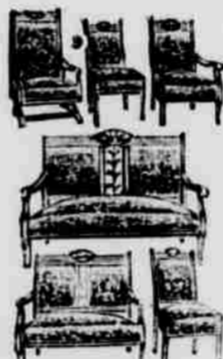
5-piece Parlor Suit; fancy upholstered; as low as $22.50.