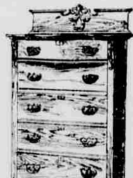
GOLDEN OAK Chest-dresser; as low as $5.75