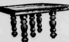
Fine Polished Extension Table; hard wood; as low as $4.50

Our great line of Carpets, Linoleums, Oil Cloths and Mattings at correspondingly low prices.