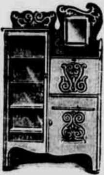
GOLDEN OAK Book Case; Highly Polished; as low as $12.50.

to buy your Furniture abroad. Besides saving you a freight bill, we also save you from 15 to 25 per cent. on each and every article purchased from us. Be wise and consider our low price offers.