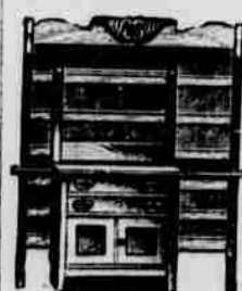
3-piece Bedroom Suit; golden oak finish; as low as $12.50.