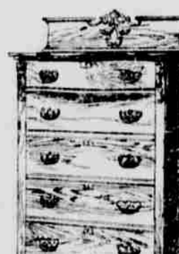
GOLDEN OAK Chiffonier; as low as $5.75.