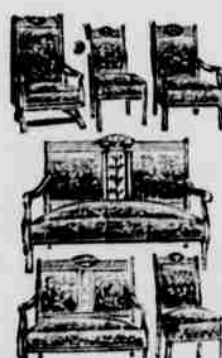
5-piece Parlor Suit; fancy upholstered; as low as $22.50.