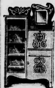
GOLDEN OAK Book Case; Highly Polished; as low as $12.50.

to buy your Furniture abroad. Besides saving you a freight bill, we also save you from 15 to 25 per cent. on each and every article purchased from us. Be wise and consider our low price offers.