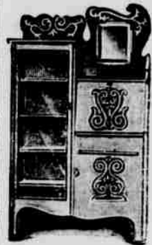
GOLDEN OAK Book Case; Highly Polished; as low as $12.50.

to buy your Furniture abroad. Besides saving you a freight bill, we also save you from 15 to 25 per cent. on each and every article purchased from us. Be wise and consider our low price offers.