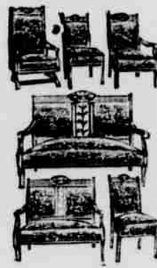
5-piece Parlor Suit; fancy upholstered; as low as $22.50.