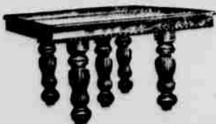
Fine Polished Extension Table; hard wood; as low as $4.50.

Our great line of Carpets, Linoleums, Oil Cloths and Mattings at correspondingly low prices.