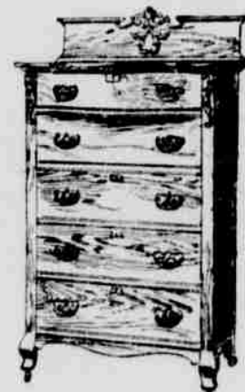
GOLDEN OAK Chest; as low as $5.75.