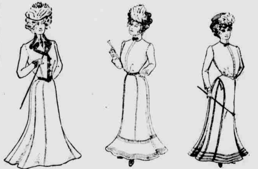
Suit made of an Oxford gray Venetian, trimmed in black braid, silk lined jacket; price, $15