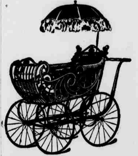
This fancy carriage, rubber tires, rattan basket, silk lace parasol..... $10.50 Others as low as $5.00.