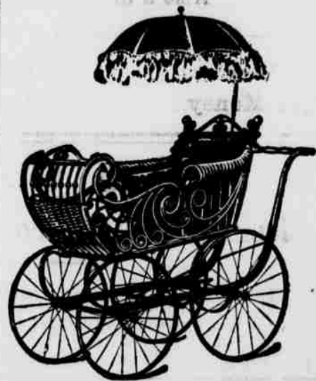
This fancy carriage, rubber tires, rattan basket, silk lace parasol. $10.50 Others as low as $5.00.