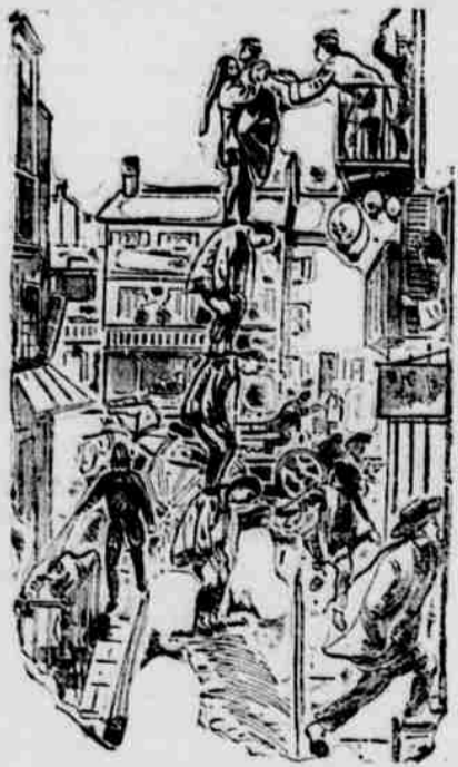
This Season's Big Success. The great Chinese-American Sensation,