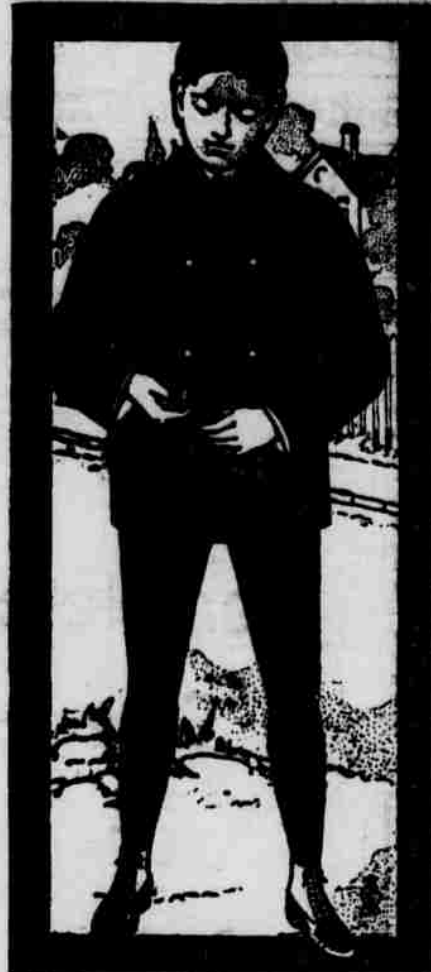
In this sale are included— Double-Breasted Suits, REEFER Suits, VESTEE Suits, JUNIOR Suits.