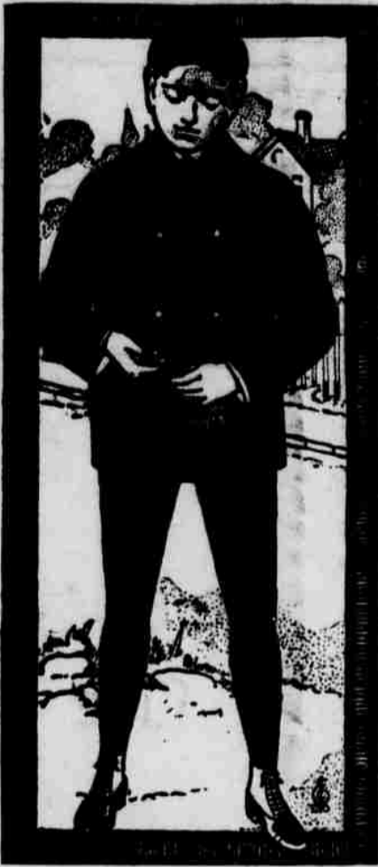
In this sale are included— Double-Breasted Suits, REEFER Suits, VESTEE Suits, JUNIOR Suits.