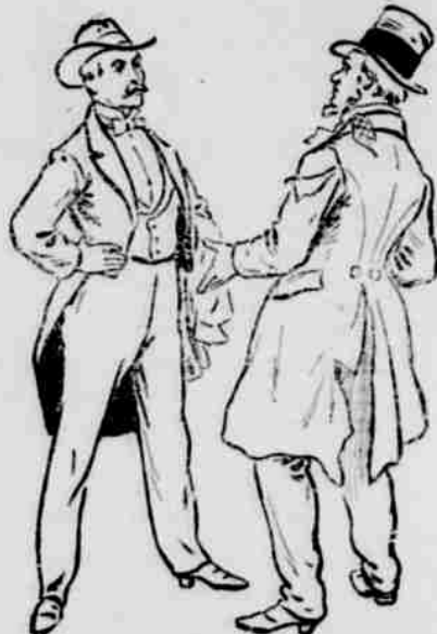
The now famous farcial query.