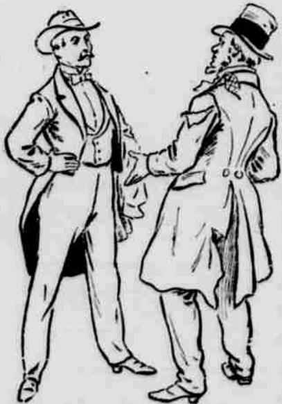
The now famous farcial query,