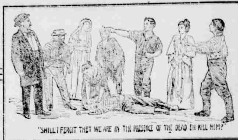
"SHALL I FORGET THAT WE ARE IN THE PRESENCE OF THE DEAD EN KILL HIM?"

That grand and beautiful play, The Idol of the Arkansas Hills.