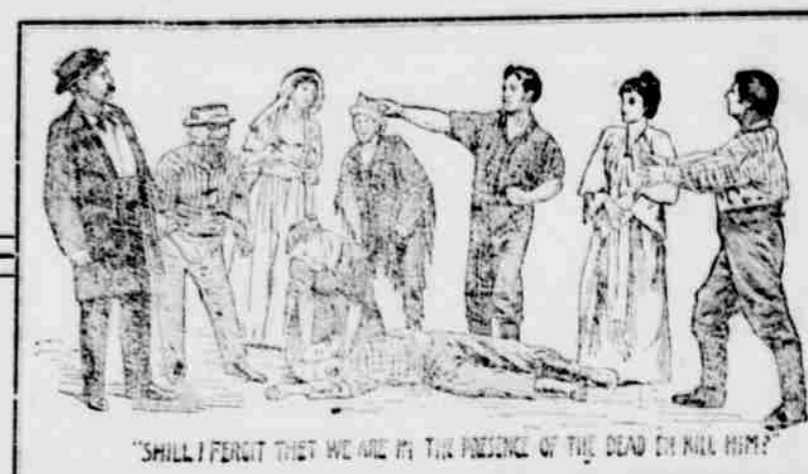
"SHALL I FORGET THAT WE ARE IN THE PRESENCE OF THE DEAD BY HILL HIM?"

That grand and beautiful play, The Idol of the Arkansaw Hills.