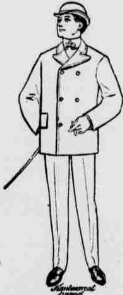
Young men's double breasted square cut suits, fit perfectly. 8 new patterns in worsteds and tweeds. Per suit, $7.50 to $13.75

If the pants you like best are too long, we them cut off for you. Twont cost you a cent extra. We fit every garment.