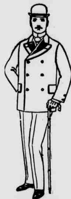
EMPIRE Copyright 1898, Fuchsner, Fabel & Co. Silk faced, double-breasted sack suits for men. Special; Blue herring-bone stripe Serge, as above cut, $13.75