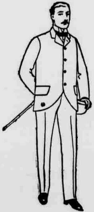
Men's 4-button round sack suits; 47 different styles and patterns, per suit, $5 to $25

we sell are Made to Fit Perfectly and Pressed free of charge.