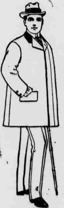
Men's stylish Top Coats, Covert cloth, $10, $13.75, $15, $17.50, $20.