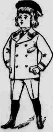
Reefer coat; for boys from 10 to 15 years; Rumbold chinchilla, navy beaver, $4.00 and $5.00