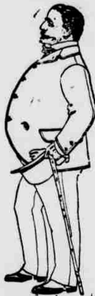
Stout men's 4-button Round Sack Suits $7.50 to $20.00. One of the main features of this complete stock is that we can fit perfectly the man who is hard-to-fit, be he short and stout or tall and thin. Try us.

We have the coat pressed, the pants creased, and any little alteration made that is necessary to insure a good fit at no additional expense to you.