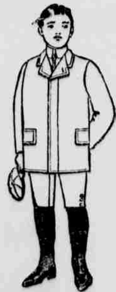
Tan Melton Top-Coat, 7 to 9 years and 10 to 14 years, $4.50, $5.50, $6.50. Stylish and evidence of good taste.