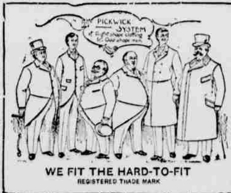
WE FIT THE HARD-TO-FIT REGISTERED TRADE MARK