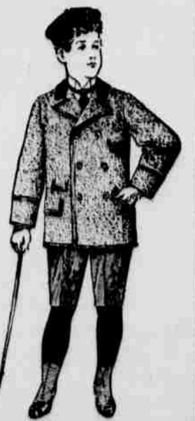
Reefer Coats, substitute for an Overcoat; 3 to 8, and 9 to 15 years. Made of Astrachan, Beaver, Chinchilla and Covert cloth, $2 to $6