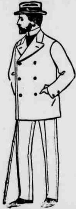
Men's double breasted square cut sack suits, made in blue serge, blue or black chevot, cassimere, scotch tweed, and fancy striped worsted, and brown meltons; per suit, $10 to $20

If the pants you like best are too long, we them cut off for you. Twont cost you a cent extra. We fit every garment.