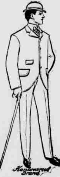
Young men's 4-button round cut sack suit, for from 16 to 20 yrs, modeled after our finest men's suits; perfect in fit and of faultless finish, $7.50 to $15

We have the coat pressed, the pants creased, and any little alteration made that is necessary to insure a good fit at no additional expense to you.