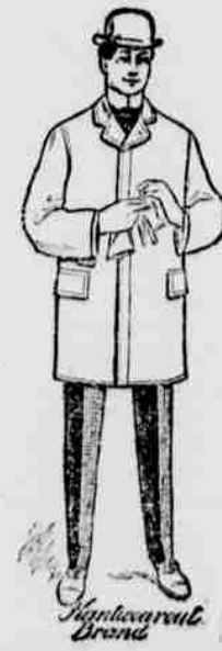
Young men's stylish Covert Top-Coats, by America's best makers. $7.50, $10, $12.50, $13.75, $15. Sizes, 16 to 20 years.

Pickwick Suits and Overcoats; $10 to $20 $15 to $30