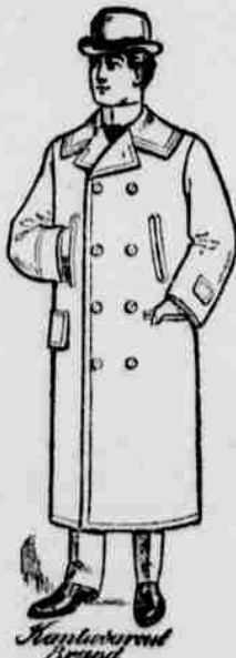
Young man's storm ulster; neat and dressy, warm and serviceable; $3.50 to $13.75. In gray or black heavy meltons, brown checked cassimere and black frieze.