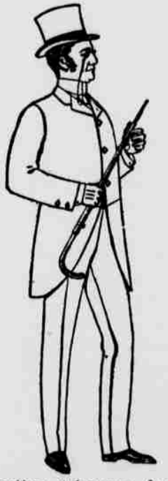
Men's 3-button cut-a-way frock suits, suits for every day or Sunday wear. Cassimere at $10; striped or pin-head worsted at $12 to $17; black clays, $7.50 to $25.