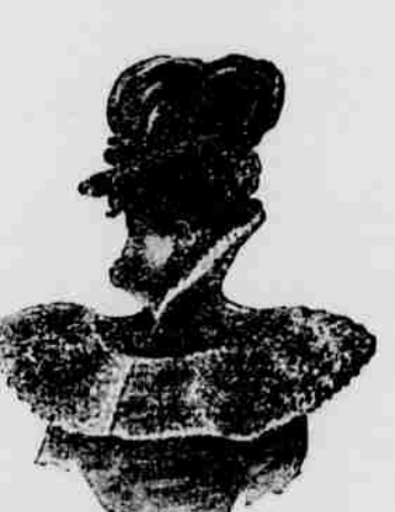
Chinchilla, trimmed in elec-