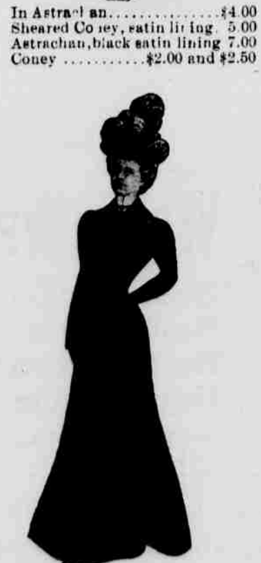
Tailor-made Suit; made of fine quality gray homespun; double-breasted Elton Jacket, lined throughout and faced with Skinner satin; new shaped scalloped tonic skirt.....$20.00