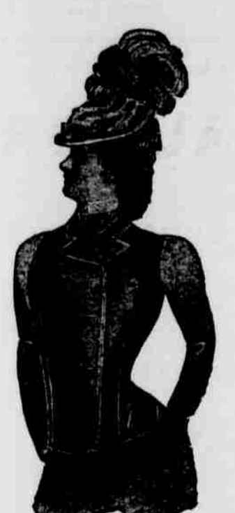
(Brown, plaid back; $5 00)