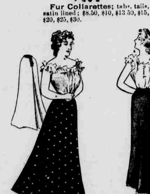
Tailor-made Dress Skirts. Plaid Skirts; new shapes, new colorings . . . . . $4, $5, $6, $7.50 Newest shape habit back skirt,Oxford Cloth,very stylish $3.85