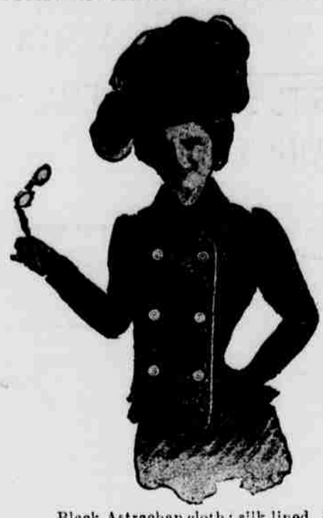
Black Astrachan cloth; silk lined, $10 00