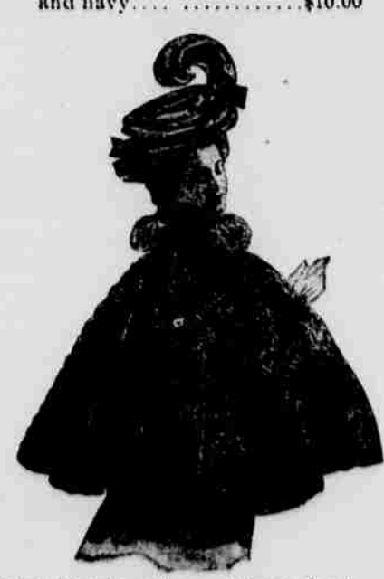
Black Boucle, collar and front edged with black thibit fur ......$3.00