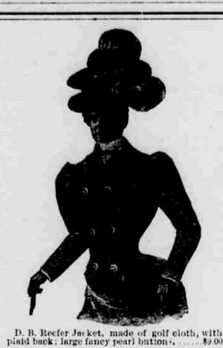
FALL EXHIBIT 1899