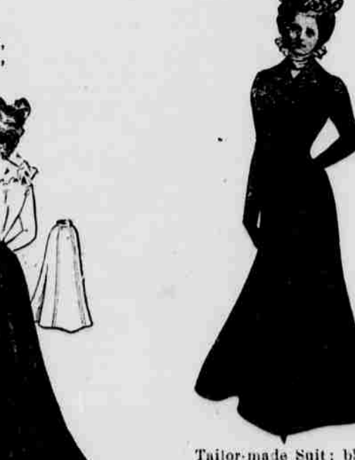
Tailor-made Suit; blue mixed Metonet; new style skirt ........$3 50