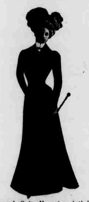
Tailor-made Suit; Venetian cloth in