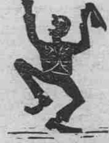
Nutting in the sixth.

When it was discovered the score stood 24 to 12 in favor of the Mays & Crowe push, a ringing shout went up from the crowd, while the two teams