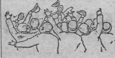
After the game.

The spectators are indebted to the two firms for a pleasant afternoon, and express the wish that Dry Goods will soon challenge Hardware to another game.