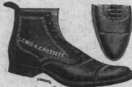
English Walking Shoe.

A snap. A shoe, fashionable, comfortable, seasonable, and serviceable, is here offered at a bargain price. Made of box calf; bulldog toe, heavy extension soles, yellow silk stitching. $4 Shoe, now $2.95