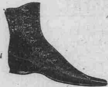
Misses' and Children's Fine Shoes

IS NOW ON. In announcing this sale we lay particular stress upon the fact that every broken line or odd lot of Ladies' Misses' and Children's Fine Shoes in the house are subjected to a SLASHING PRICE CUT—deep enough to interest every shoe buyer, and especially those looking for shoes of quality. Just a few hints here—more in our Shoe Department.