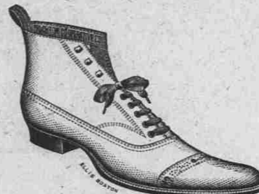
Black or Brown.

Shoes made for winter wear; heavy extension soles, broad low heels, serviceable uppers, wide coin toes; regularly $3, clearance price $2.00