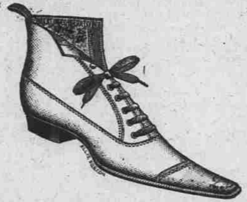
Quality, not Style.

If you are not particular as to the style, these will suit you. An assorted lot of Men's Fine Street Shoes in seal and kangaroo stock, including also fine calf shoes with cork soles. The regular prices are $4 and $4.50; the clearance price $2.75