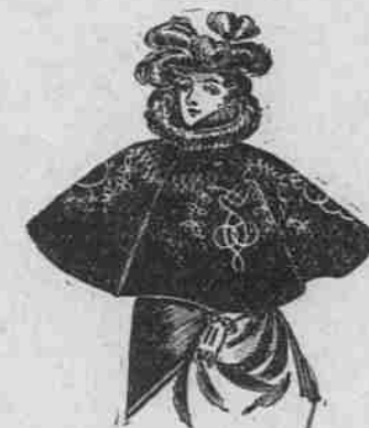
No. 4434--Ladies' Cape, made of Seal Pish, handsomely embroidered with Sautache fringe, storm collar, edged with Aurora fur, former satin lining, 18-inch length. Our price.....$3 00

For the Fall and Winter season of 1898-9 are here in profusion, awaiting your inspection.