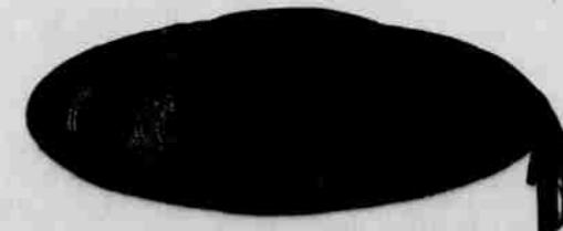
Misses' and Children's Straw Sailors. We mean what we say; The best 25c Sailors in town are to be found at