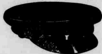
Linen Crash or White Duck Yacht Caps; Black patent leather bill 25c and 50c. Same in Silk Crash, 75c. Nice for Cycling wear.