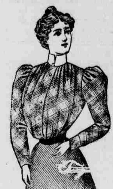
This style can be had in all this seasons choicest fabrics, patterns

Showing style of our special 50c Shirt waist. Made with yoke, detachable collars of same material, and can be had in a great variety of checks and small plaids in medium and light colorings. All sizes to 42...... 50c and colorings.