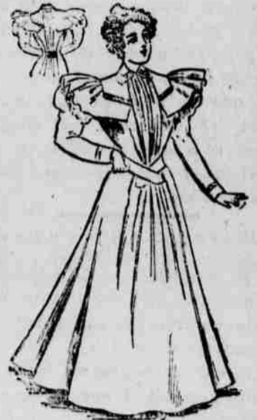
Our celebrated $1 wrapper, made as style illustrated and can be had in blue, black and white, feathered braid, fitted lining. $1.00 correct widths.