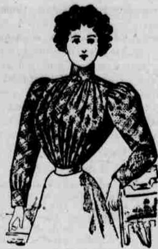
Showing style of our special 50c Shirt waist. Made with yoke, detachable collars of same material, and can be had in a great variety of checks and small plaids in medium and light colorings. All sizes to 42.

We wish to convince you of the fact that by buying your waists of us you buy the best money can buy. "It is agreeable to know that what you wear is right."