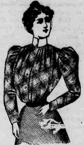
This style can be had in all this season's choicest fabrics, patterns and colorings. 50c

Showing two of our most popular styles in wrappers. In this line, as in Shirt waists, we can offer you choice of largest variety, newest patterns and materials at most popular prices. 75c to $2.50.