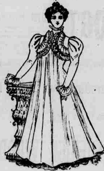
Lawn wrapper, handsome colorings, pretty designs; effects, blue pink and lavender, bolero front edged with val lace, fitted lining, finished seams in armholes. $1.00 correct widths.

Showing two of our most popular styles in wrappers. In this line, as in Shirt waists, we can offer you choice of largest variety, newest patterns and materials at most popular prices. 75c to $2.50.