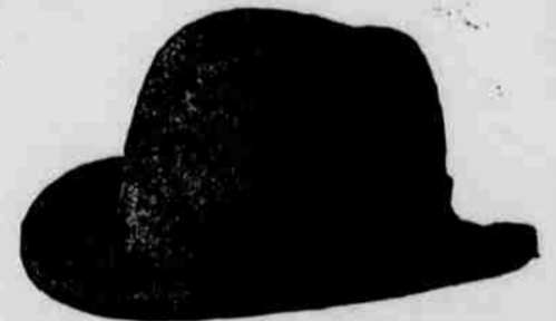
Latest Alpines, Hazel, Pearl, Tobacco, Black and Brown.