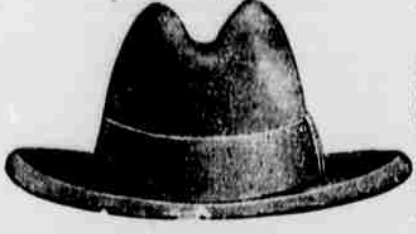
Latest Blocks and Colors. $2.00, $2.50, $3.00, $3.50.

Where will you find a more tasty hat than is represented by this cut, suitable for almost any age and strictly in style. Buy any price that will suit your purse, from $2.00 to $3.50.