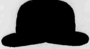
In Black or Brown. $3.00.

You would not consider $5.00 too much to pay for this hat, but we have marked it to sell at $3.00.