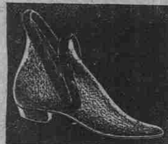
Ladies' "Juliet's," Fine Quality Felt, Fur Trimmed, Leather Soles and Heel, colors—Black, Red and Brown, sizes 2½ to 7, $1.70. Same for Miss' and Children, sizes 7 to 10½, $1.25; 11 to 2, $1.45.

Evenings at Home made doubly enjoyable. The daily house duties less severe. By wearing our