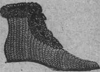
Ladies' Crochet High Laced Boots, Leather Soles, Pink, Black, Red, sizes 3 to 7, $1.25.