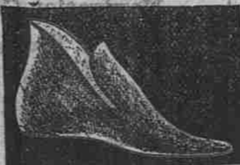
Gent's "Romeo" Felt, black only, leather soles, $2.00.