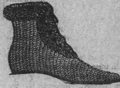
Ladies' Crochet High Laced Boots, Leather Soles, Pink, Black, Red, sizes 3 to 7, $1.25.