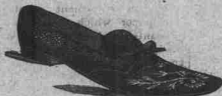
Gent's Velve Everett's, handsomely embroidered, sizes 6 to 10, $1.25 and $1.75. Gent's Kid or Alligator Slippers, $1.25 and $1.75.