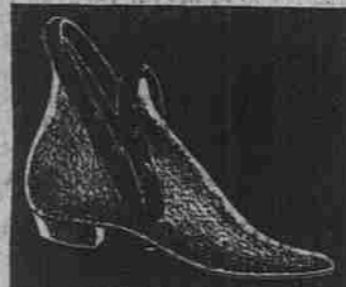
Ladies' "Jullets," Fine Quality Felt, Fur Trimmed, Leather Soles and Heel, colors—Black, Red and Brown, sizes 2½ to 7, $1.70.