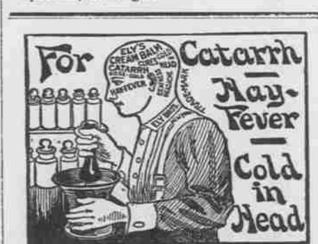
ELY'S CREAM BALM is a positive cur Apply into the nostrils. It is quickly absorbed. 50 cents at Druggists or by mail; samples 10c. by mail. ELY BROTHERS, 56 Warren St., New York City.

Upright and faithful gentlemon or ladies to travel for responsible estab-lished house in Oregon. Monthly $65 and expenses. Position steady. Refer-erence. Enclose self-addressed stamped envelope. The Dominion Company, envelope. The I Dept. H., Chicago.