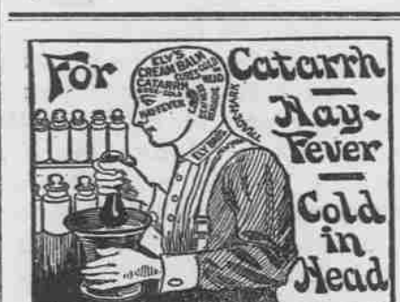
ELY'S CREAM BALM is a positive cure

Capital is going around seeking a place for use. Let it not pass The Dalles by as it has done in former