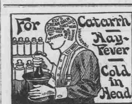
ELY'S CREAM BALM is a positive cure. Apply into the nostrils. It is quickly absorbed. 50 cents at Druggists or by mail; samples 19c. by mail, ELY BROTHERS, 56 Warren St. New York City.