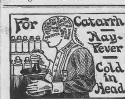
ELY'S CREAM BALM is a positive cure Apply into the nostrils. It is quickly absorbed. 6 cents at Druggists or by mail; samples 18c, by mail. ELY BROTHERS, 56 Warren St., New York City.

Every assertion which Bryan made The people who listened to Bryan that has a direct bearing on the situin St. Louis heard a strange medley ation of 1896 or 1897 is a falsehood, of irrelevancies, of misinterpretations and known to be such by himself. Every sane person who heard Bryan of assertions, that is to say, which in St. Louis, or who reads him, will had no application to the things be profoundly grateful that the which he was talking about, of con- United States has been forever saved fusion of mind as to the meaning of from the humiliation of having such these things, and of falsehoods. The a shallow trickster and proven and first and second classes of Bryan's persistent falsifier in the chair of