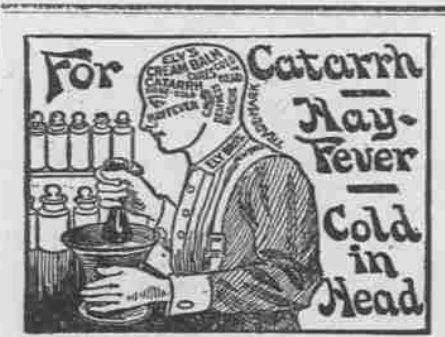
ELY'S CREAM BALM is a positive cure. cents at Druggists or by mail; samples 10c. by mail. ELY BROTHERS, 56 Warren St., New York City.

England threatens, under certain conditions, to keep her gold. This threat is easily made, but when she gets hungry she will have to part with her gold, or its equivalent.