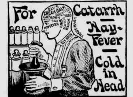
ELY'S CREAM BALM is a positive cure. Apply into the nostrils. It is quickly absorbed. 50 cents at Druggists or by mail; samples 10c. by mail. ELY BROTHERS, 56 Warren St., New York City.

We will give One Hundred Dollars for any case of Deafness (caused by catarrh) that cannot be cured by Hall's Catarrh Cure. Send for circulars; free. F. J. CHENEY & Co., Toledo, O. Sold by Druggists, 75c. 6-10