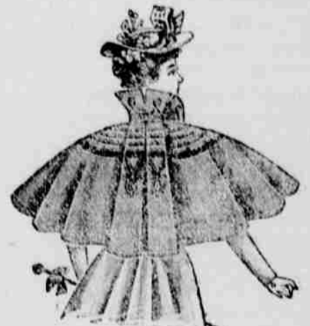
No. 2769—A most stylish Black French Diagonal Cloth Cape, and elaborately trimmed in Soutache and Hercules Braids. Price $5.50.