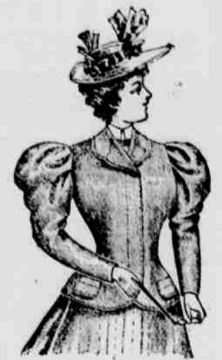
No. 1694 is a beautiful Prussian-Blue English Coverlet Cloth Jacket, designed as above cut. A strictly tailor-made garment, strapped seams, and silk-lined throughout. Price, $9.75.