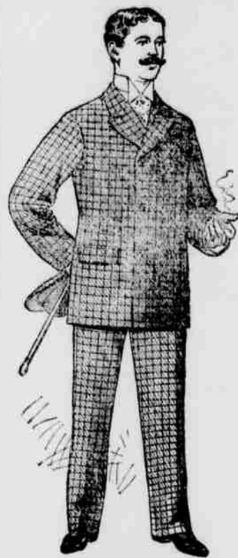
D. B. SACK MEN'S SUITS.

Any grade, and at any grade worth the price asked.