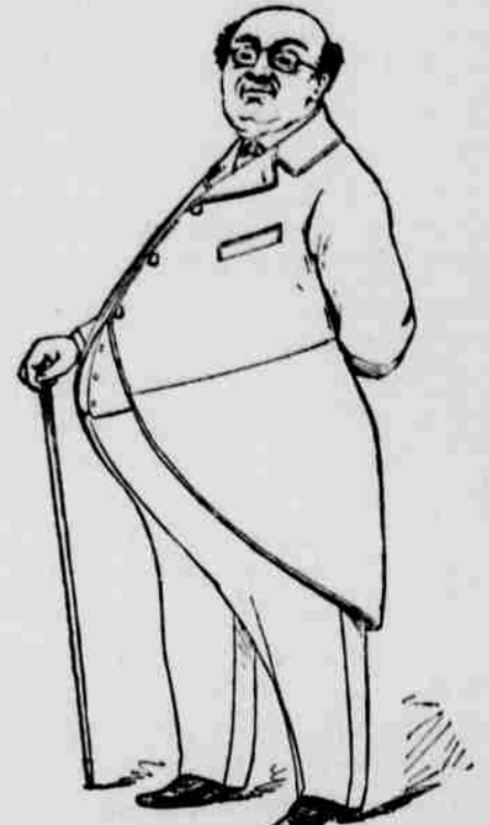
Mr. Pickwick PICKWICK STOUT.

We are prepared to fit any and everyone, especially men who are classed as HARD-TO-FIT.