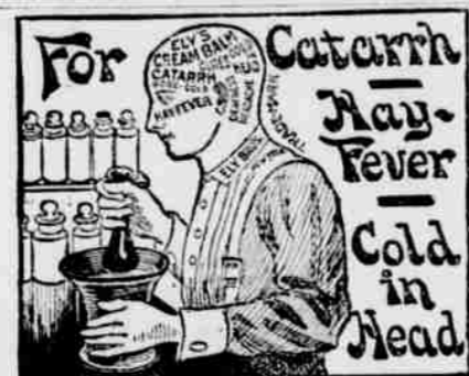
ELY'S CREAM BALM is a positive cure. Apply into the nostrils. It is quickly absorbed. 50 cents at Druggists or by mail; samples 10c. by mail. ELY BROTHERS, 56 Warren St., New York City.

Greece has taken a determined stand, and declares her readiness to fight all Europe rather than abandon Crete. We admire her pluck, and deplore her weakness.