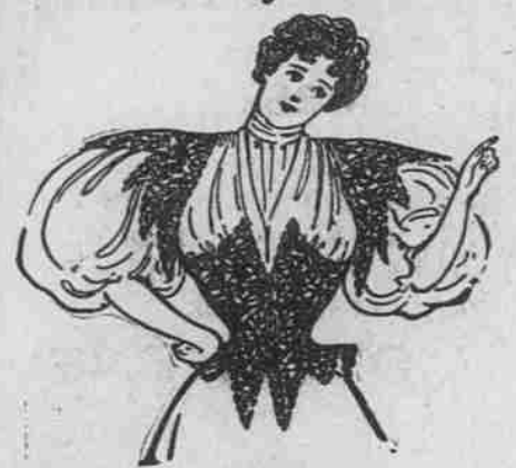
Made perfect by wearing faultless