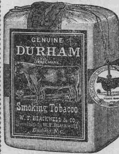
The Best Smoking Tobacco Made

You will find one coupon inside each 2-ounce bag, and two coupons inside each 4-ounce bag. Buy a bag, read the coupon and see how to get your share.